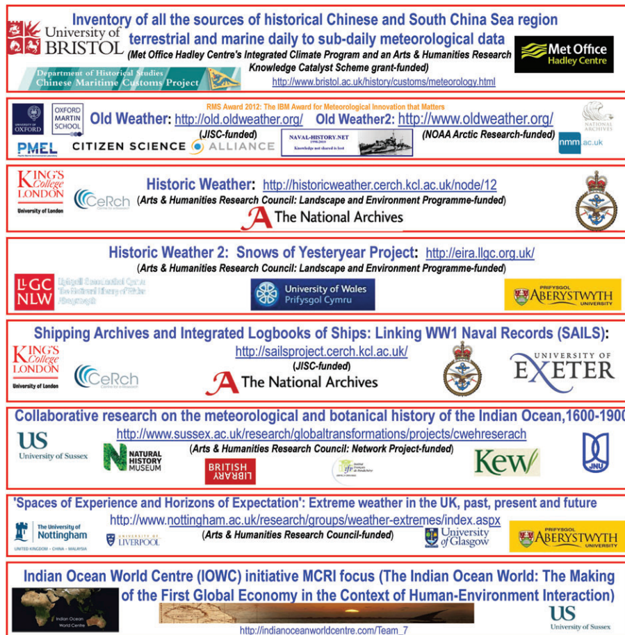
FIGURE 2 | ACRE collaborations with Citizen Science, Social Sciences, Humanities, and Arts projects.

is the 3-year AHRC-funded research project, supported under the AHRC's Care for the future: thinking forward through the past theme and led by the University of Nottingham, with colleagues at Aberystwyth, Glasgow and Liverpool Universities and in partnership with ACRE (Figure 2), The Royal Geographical Society (with the Institute of British Geographers) and Historic England. This team is recovering and integrating historical documentary evidence of past extreme weather events in a series of case studies across the UK—in Southwest, Central and Eastern England, central and coastal Wales and Northwest Scotland. The research, which draws on a wide variety of materials from farmers' diaries and estate correspondence through to school records and qualitative and instrumental weather diaries, is providing the evidence needed to construct a comprehensive history of extreme weather events and their societal implications across the UK over recent centuries ( http://www.nottingham.ac.uk/research/groups/weather-extremes/index.aspx ).