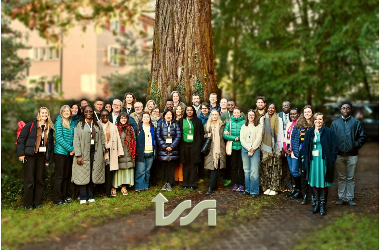
Figure C1. Participants of the ISSI–WCRP Workshop “ Opening up Earth Observations for Climate Adaptation ”,