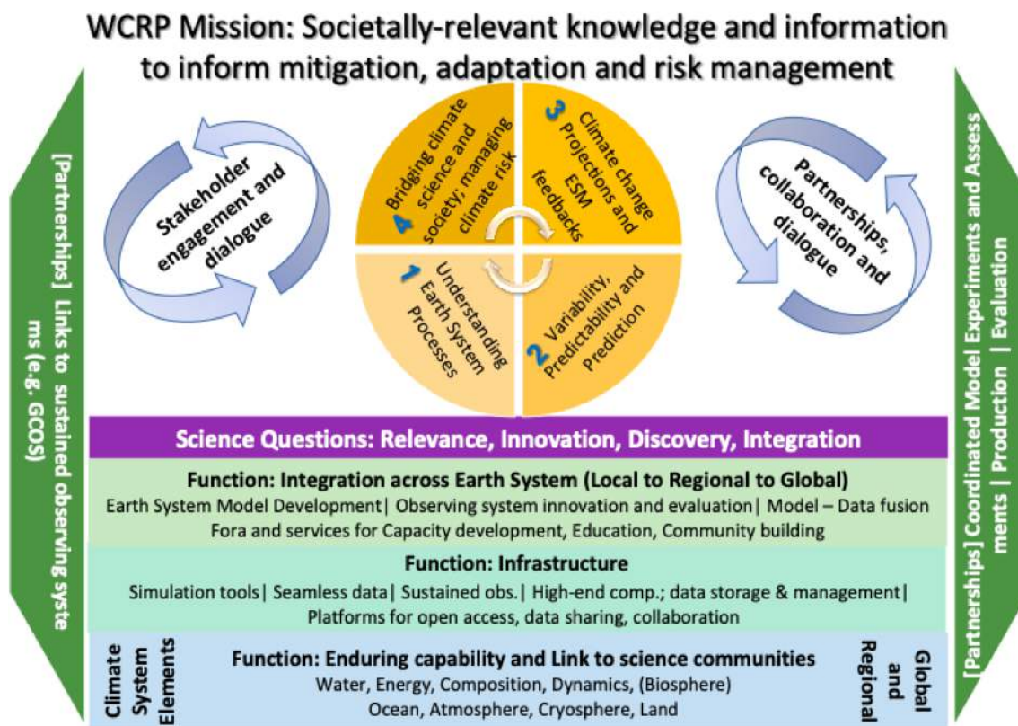
Figure 1: The conceptual framework for implementing the WCRP Strategic. The version above is taken from the end of the WCRP JSC-40 Session. The Conceptual Framework as at the end of the Implementation and Transition Meeting is provided in Annex 6.

There was a lot of discussion about which boxes in the conceptual framework are permanent and in which boxes the people sit, with some participants seeing the community existing solely in the blue and green boxes and others seeing them as also sitting in the yellow boxes (conducting delivery of information, for example). In other views, the boxes are not independent, with the yellow boxes being the aspirational objectives of the Programme and the green and light blue boxes being the work done, with the green box being the integration needed to get to the yellow boxes. The key science questions could also be framed as outcomes. In addition, it was thought that the regional focus should be more visible in the framework.