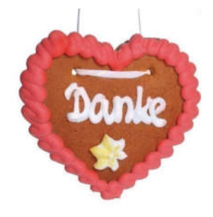
<u>Oktoberfest-style cake:</u> Heart-shape with icing saying "thanks" (in German)

While half a dozen of co-chairs march off the stage, we briefly mention the decisive contribution of the members of the LOC and SOC. All 23 persons, mentioned on page 2 of the programme booklet, receive after the end of closing ceremony nutritious tokens of heartfelt gratitude as their personal awards. – And I hand over to the programme co-chair ..."