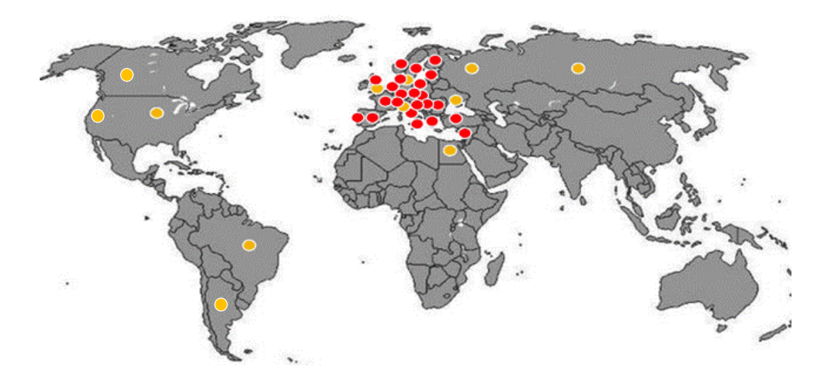
Figure 1. Participants from European COST countries (red dots) and external institutions/experts (yellow dots) contributing with their expertise to the COST Action ES1004 EuMetChem

The European COST Action ES1004 EuMetChem (European Framework for Online Integrated Air Quality and Meteorology Modelling; 2011-2015) aimed at developing a strategy and framework for online integrated modelling by identifying relevant interactions, parameterizations and feedback mechanisms and considering chemical data assimilation in integrated models. The status of integrated modelling has extensively been summarized by Baklanov et al. (2014) and a large number of regional model systems have been thoroughly evaluated in the joint European – North American Air Quality Model Evaluation International Initiative (AQMEII-2) (Galmarini et al. 2015). The action included experts not only from Europe but also from other continents (Figure 1) to take advantage of the global expertise in this dynamic research field.